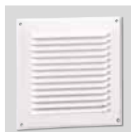
GRA-75 Aluminium exterior grille.