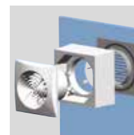
WINDOW KIT 100 Accessory to allow SILENT-100 in a window.