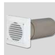
WALL KIT Fixed shutter and telescopic duct. (200 to 420 m).