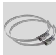
CX-80/125 Worm drive ducting clip.