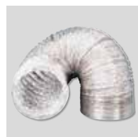
GSA-M0 100 Flexible aluminium ducting.