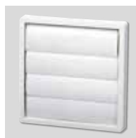
PER-100W Back draft shutter.